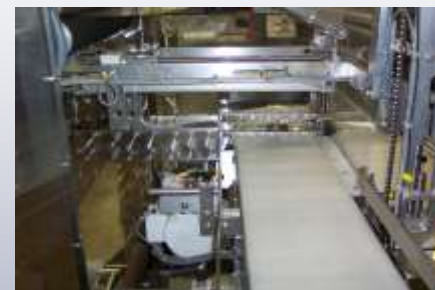
Rod-less transfer pusher, fully adjustable accumulation area and smooth product transfers