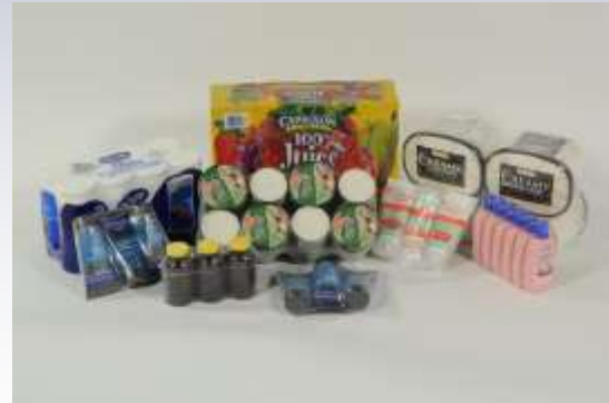
Samples of actual products run on APM Machinery equipment

Single and double-stacked products ARE POSSIBLE!