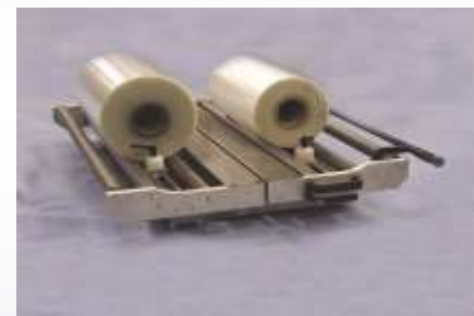
Easy load film racks