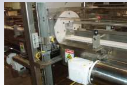
PI-2006 Product Inverter