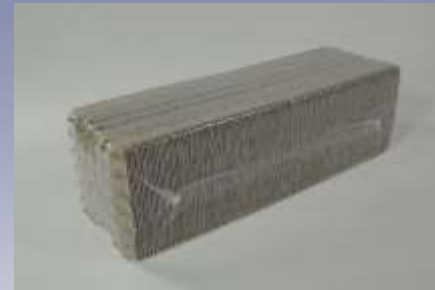
Total film enclosure available