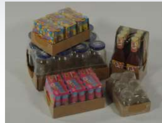
Samples of actual products run on APM Machinery equipment

Single and double stacked products can too!