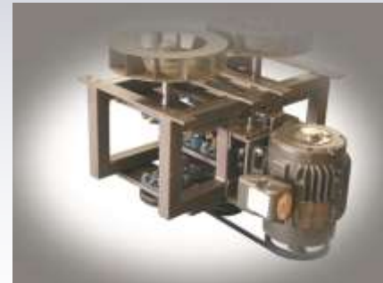
Easy access to motors