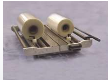
Easy load film racks