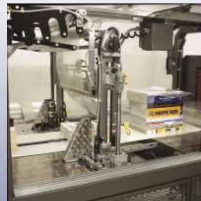
Fully supported seal frame and carriage