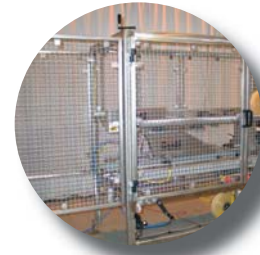
Stainless Steel Wire Mesh Guarding