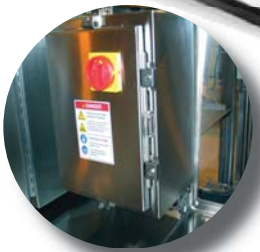
Stainless Steel or composite electrical enclosures