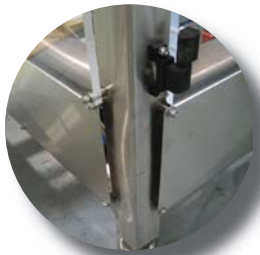
Angle and tube design. Continuous weld, welded studs and sleeves used on frames

Combi Packaging Systems offers sanitary, water wash down packaging equipment constructed from U.S. stainless steel and your choice of NEMA rated electrical components. Our simple, open designs allow for easy decontamination of all exposed surfaces.