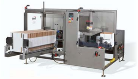
Case Erectors, Bottom Tapers to erect and seal small to extra large cases from 8 to 35 cases per minute