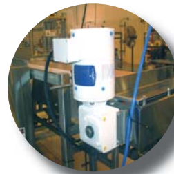
NEMA 4 compliant electrical motors and reducers