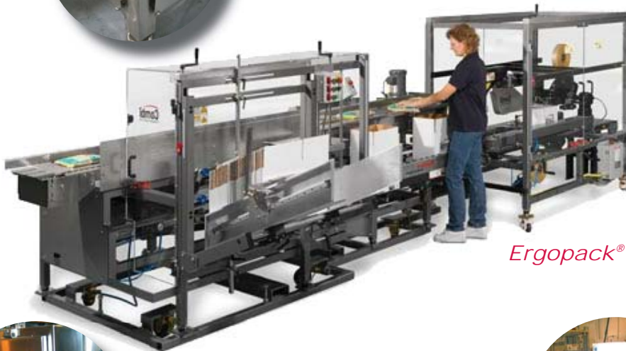
Ergopack® Hand Pack Station