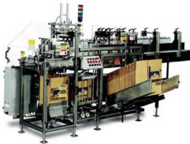
Ultra-compact Drop Packers with or without Integrated Case Erectors