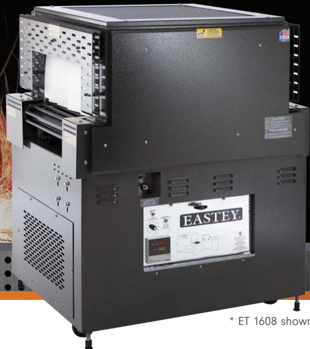
* ET 1608 shown