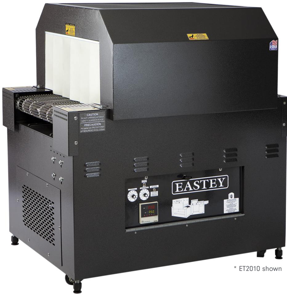
* ET2010 shown