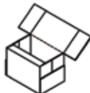
"BAG IN BOX" STYLE TRAY